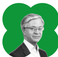
Jean-Laurent Bonnafé Director and Chief Executive Officer of BNP Paribas