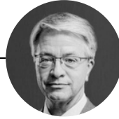
Jean-Laurent Bonnafé Director and Chief Executive Officer of BNP Paribas